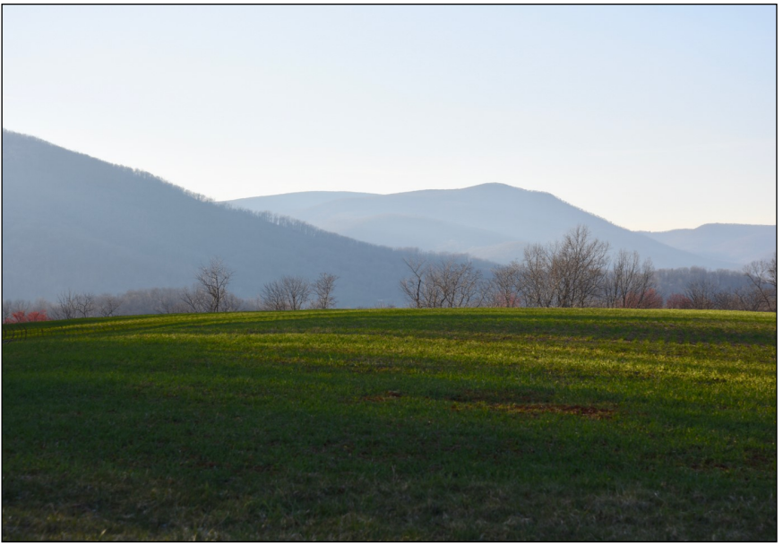
Late Light on the Park