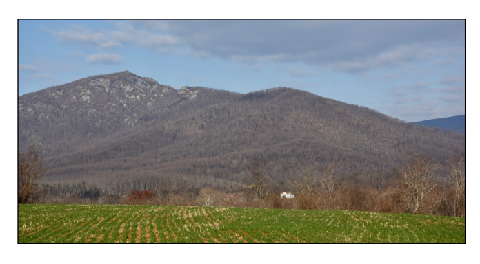
Old Rag at Mid-day