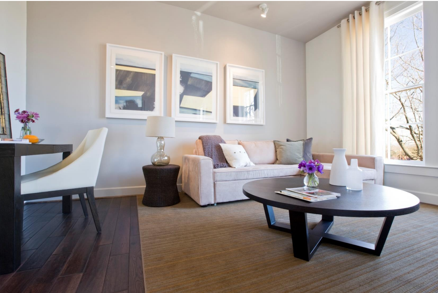
The Guest Bedrooms are Quite Luxurious