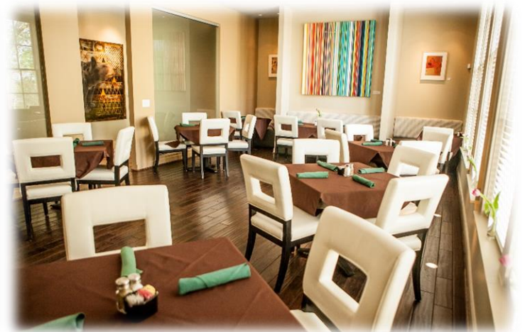
Guest Breakfast is Served in the Dining Room

We stayed three nights upstairs and were very pleased. Room was clean and modern with fresh decor. The central location of the Inn was a perfect jumping off point for visiting the great wineries that dot the landscape. We will be back" ~ Yelp Review