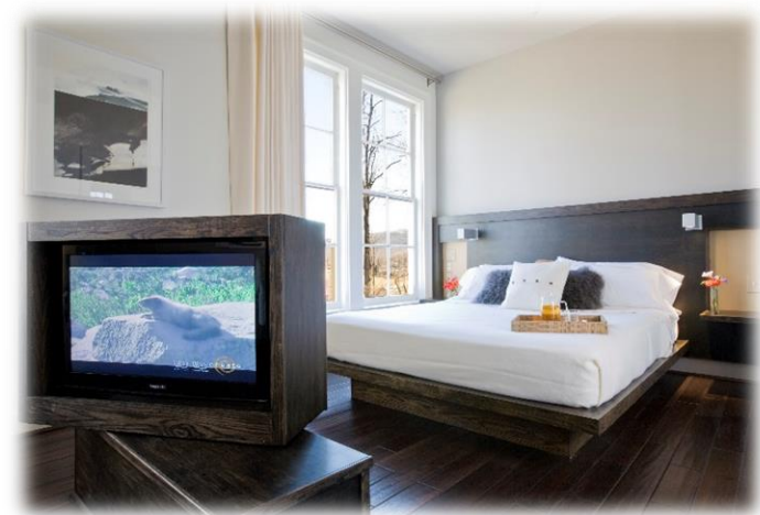
The Guest Rooms have a Clean Modern Flair