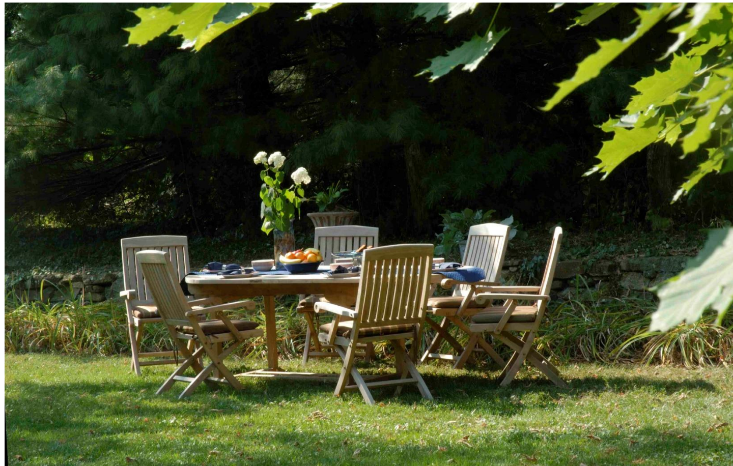
Outdoor Seating Area