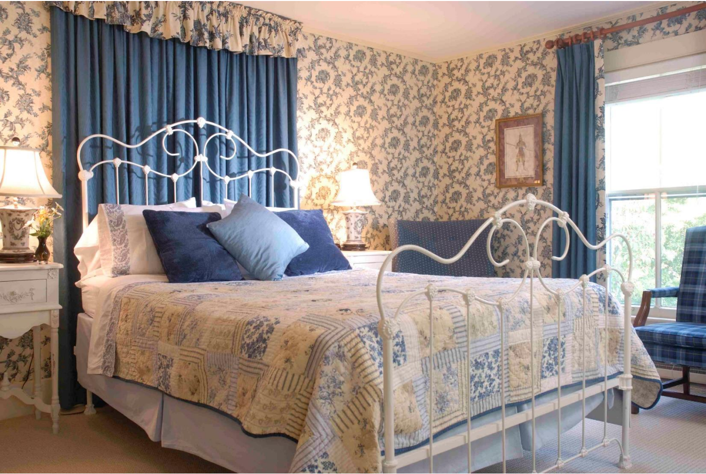
The Blue Room Guest Bedroom