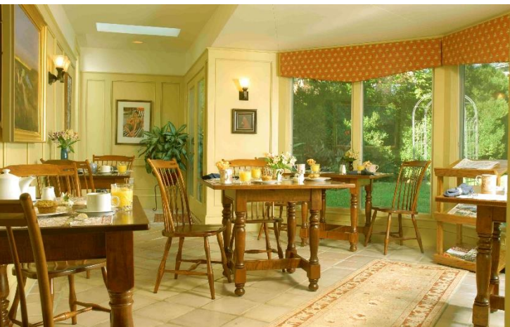
Guest Breakfast Area