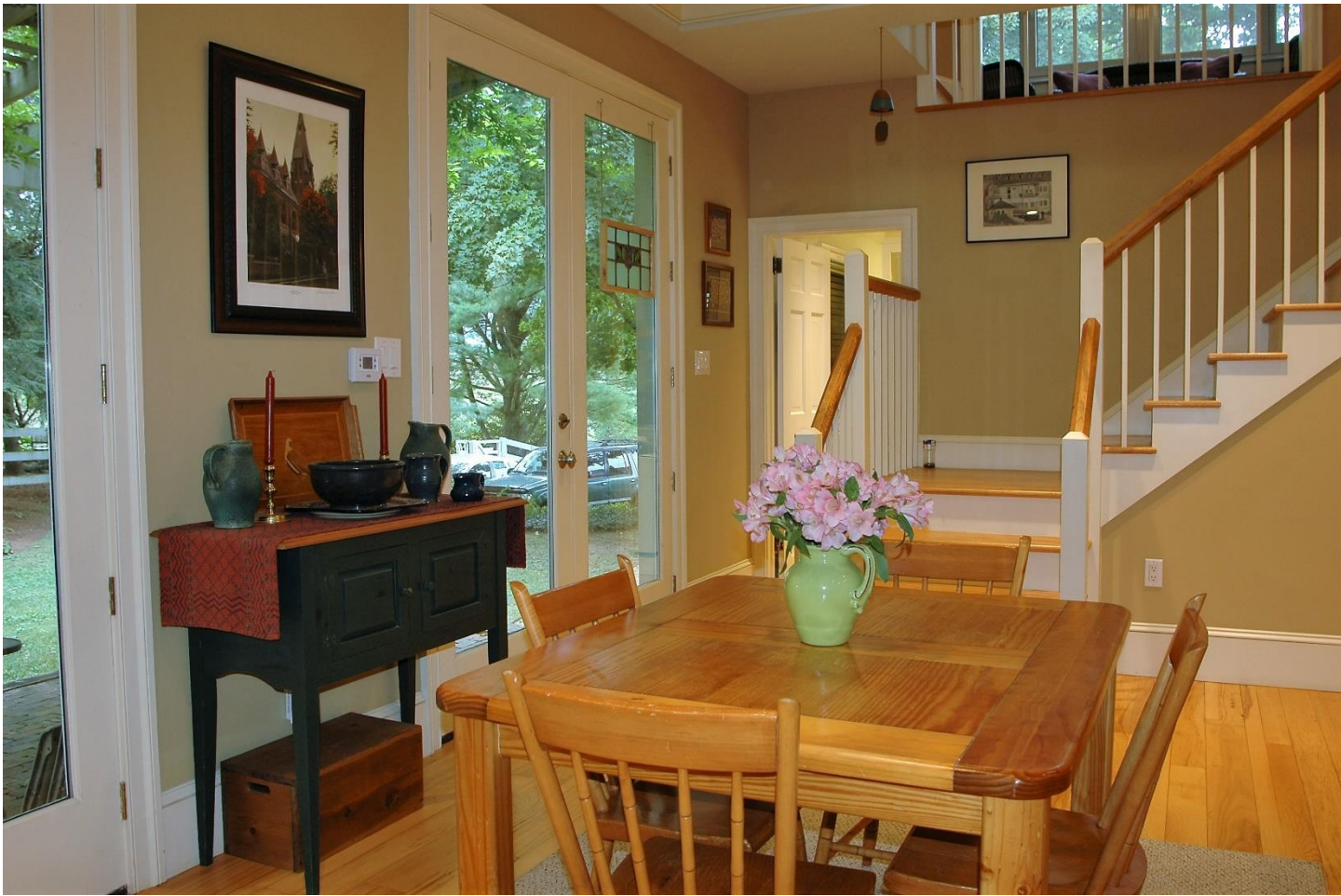
Innkeepers' Dining Room