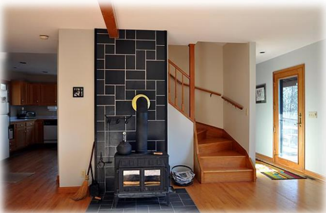
Truly, one of the highlights of the property is the one room cabin by the pond.

Set against the backdrop of a thoughtfully designed staircase, the wood stove provides an artistic focal point for the main living area.