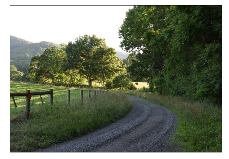
Perfect Pasture Horn Hollow Road