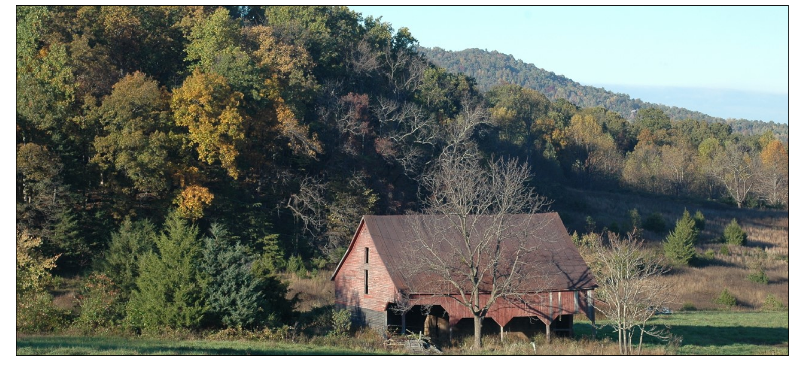
Old Red Barn